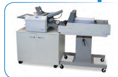
FD 38X in-line with optional V-Stack36 Vertical Stacker, stand and cabinet

Formax – New Hampshire, USA www.formax.com