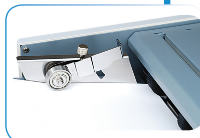
Cross Fold Guide