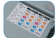
Clearly marked fold guide for quick and easy setup

The FD 300 Office Desktop Folder provides an economical solution for low-volume folding projects. This compact folder processes 11" and 14" paper at speeds up to 7,400 sheets per hour, and is clearly marked for 4 common fold settings.